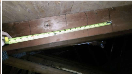
6" on center / 3 Trusses in a row