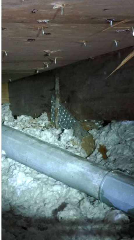
Sing Strap 2 Nails