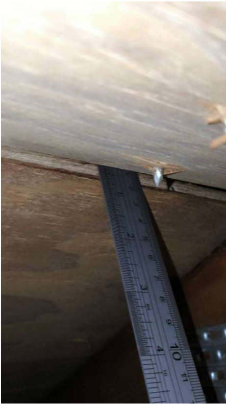
1/2 " Plywood Sheathing