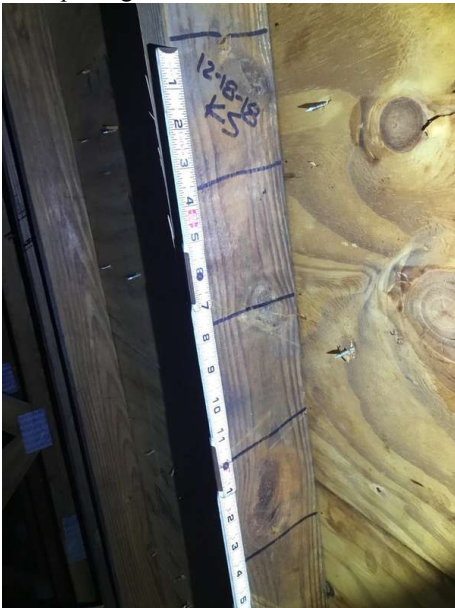
Roof to wall attachments

Inspectors Initials JB Property Address 2753 Vista Parkway , West Palm Beach, FL 33411